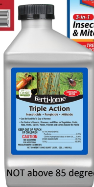
NOT above 85 degrees