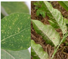
Neem Oil, Spinosad Triple Action Bayer 3 N 1