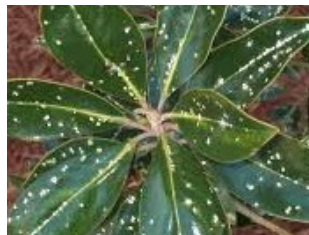
Tree & Shrub Drench Triple Action Neem Oil, Spinosad