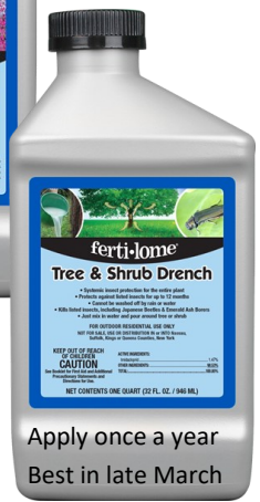
Apply once a year Best in late March