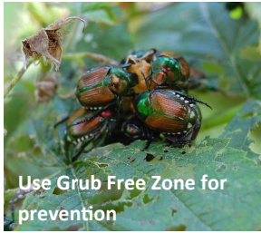
Use Grub Free Zone for prevention