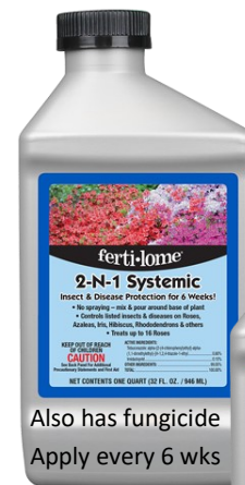
Also has fungicide Apply every 6 wks