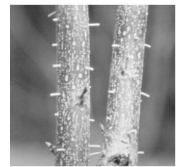
Use Triple Action as Preventative in April